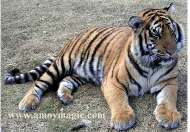
Amoy Tiger, Fujian, 2003